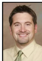
CHART Member: 6 years

Pizza Ranch, Inc. Activities Co-Director