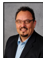
CHART Member: 2 years

Red Lobster People Development Volunteer Co-Director