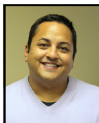
CHART Member: 5 years

McCormick & Schmick's Activities Co-Director