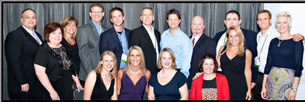
Cheers to our awesome Chicago Conference Team for planning & organizing a fabulous event with lots of learning, sharing & growing!