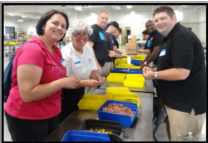
CHART Cares! Our 19th Service Event included smiles & fun on an assembly line at the Helping Hand Center.