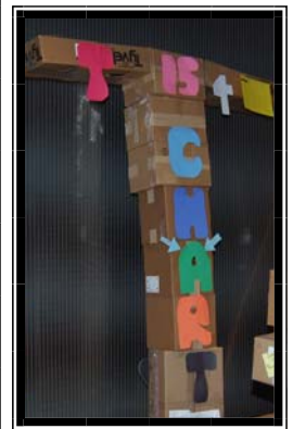
RISE ABOVE THE REST