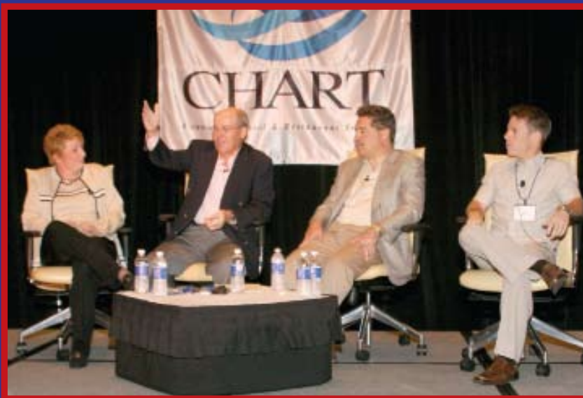
A conference highlight! See details inside.