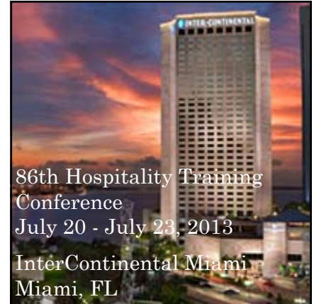
86th Hospitality Training Conference July 20 - July 23, 2013 InterContinental Miami Miami, FL

CHART's summer hospitality training conference is set to again be the premier learning forum for restaurant trainers, hotel trainers and human resource professionals. Make plans now and join over 300 members and guests at the InterContinental Miami in Miami, FL on July 20 - July 23, 2013 for the 86th CHART Hospitality Training Conference.