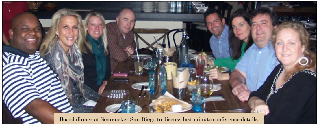
Board dinner at Searsucker San Diego to discuss last minute conference details

Stay tuned for details on our exciting new project, Training High-Five.