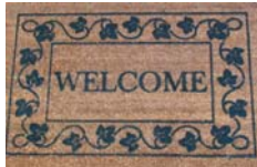
CHART extends a hearty welcome to all those who have joined since September 2012.

It is said that, "A referral is the greatest compliment we can receive." We all benefit when you share the benefits of CHART with others ... remember it may make you $300 richer! Keep on referring!